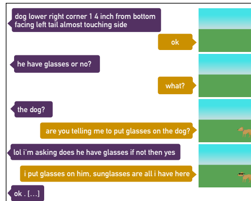
Figure 1: A communication problem occurring and being resolved with the aid of clarification requests in an instruction following interaction (CoDraw, ID 9429, CC BY-NC 4.0, scene from Zitnick and Parikh (2013)). When an instruction is not clear enough, the instruction follower asks for clarification, in order to act accordingly (here, placing cliparts in the scene).

We have recently argued that the CoDraw dataset (Kim et al., 2019) is a rich and large source of spontaneous iCRs (Madureira and Schlangen, 2023). We identified iCRs among all instruction follower utterances and proposed using the annotation to model the tasks of knowing when to ask and to reply to an iCR. However, knowing what and how to ask are also topical devices for a competent instruction follower dialogue model. To account for that, we continue this initiative by adding information